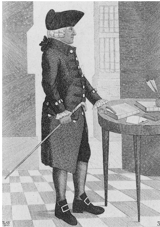
Adam Smith, considered the father of free market economic theory, favored a ceiling on interest.

The barbarian invasions also relegated much of Roman law to the shadows of history until the general revival of learning in the 17th century. When many books that had been missing for centuries reappeared, those of Aristotle became the main reference for many churchmen, including Thomas Aquinas. This complicated matters