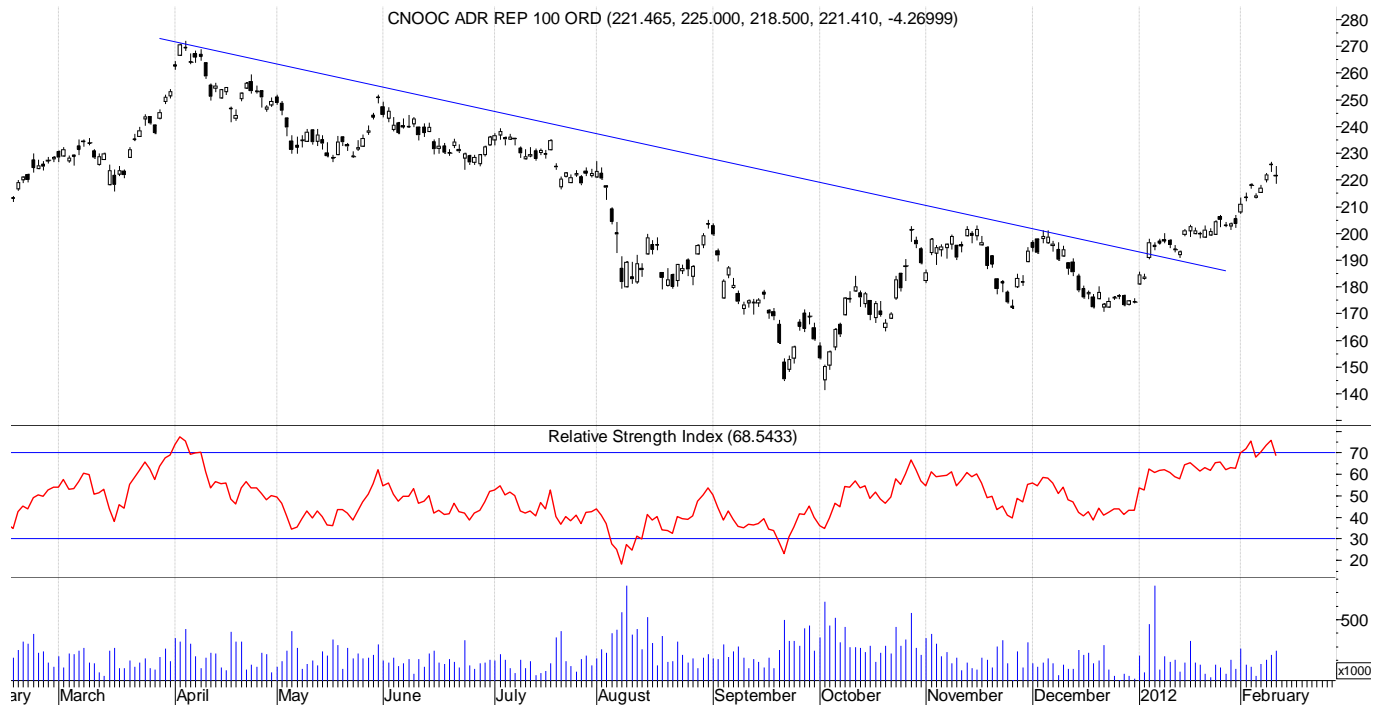
Fig 19. CNOOC Has Broken Out to the Upside, But on Light Volume