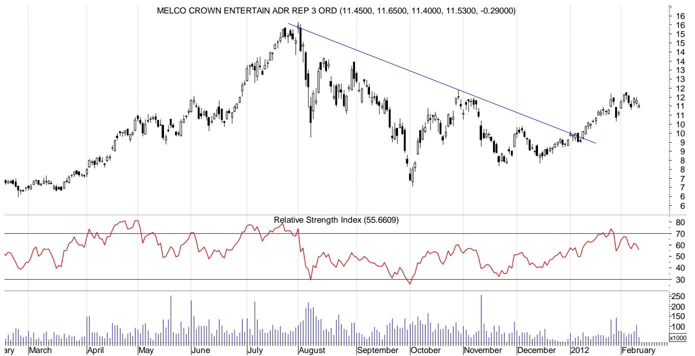
Fig 20. Melco Crown Entertainment, a Macau Gaming Company, Has Broken its Downtrend With Increasing Volume