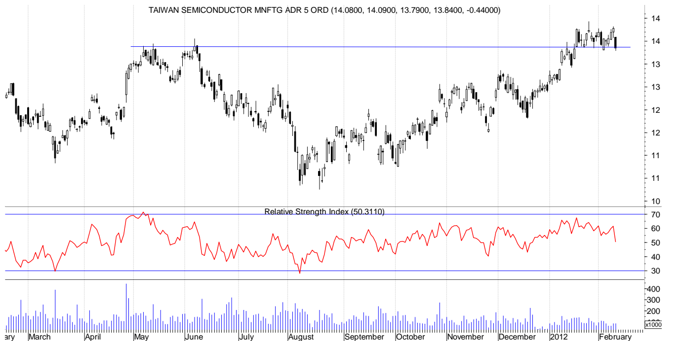
Fig 16. Taiwan Semiconductor Has Broken Old Resistance, Which is Now Acting as Support