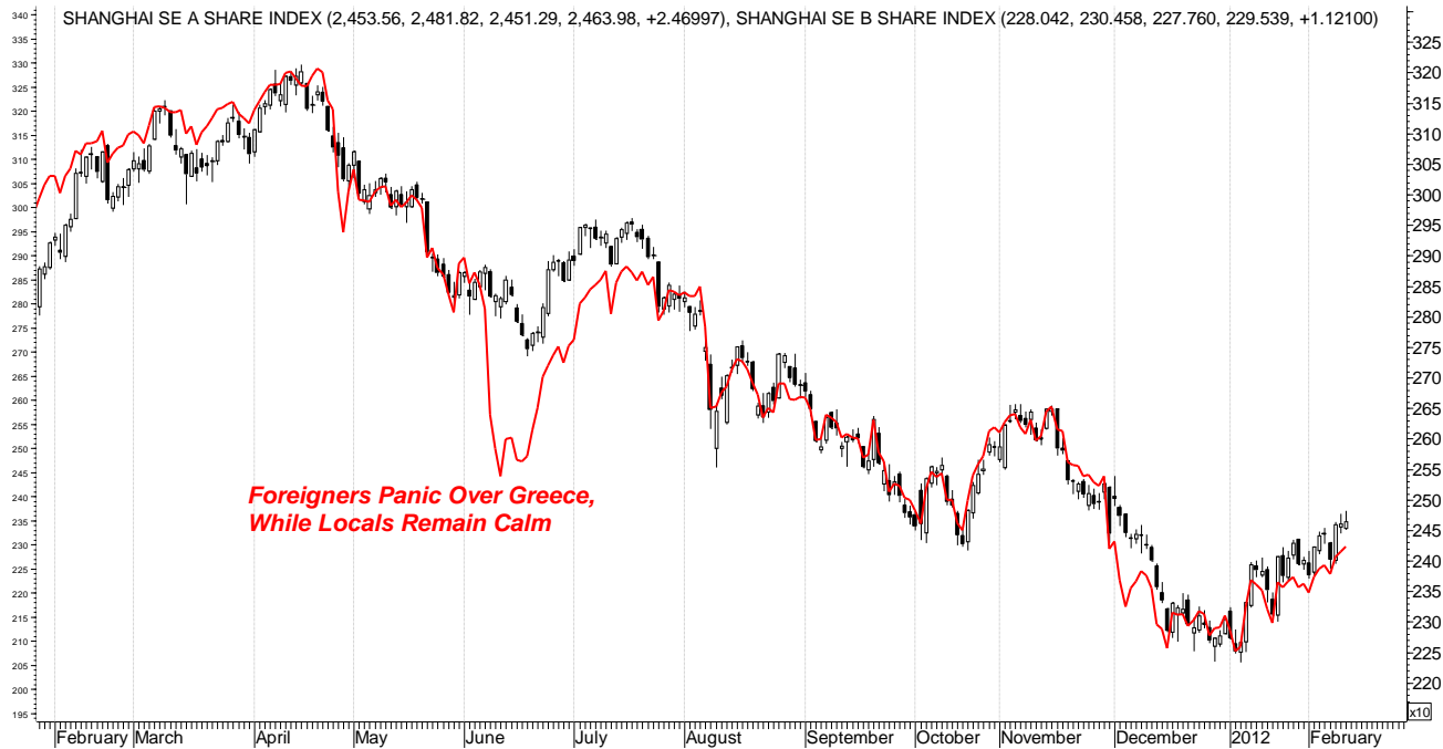
Fig 3. Shanghai A Shares, Traded in Renimbi by Locals Closely Tracked by B Shares, Traded by Foreigners, But Foreigners Panicked Over Greece in June, While Locals Did Not