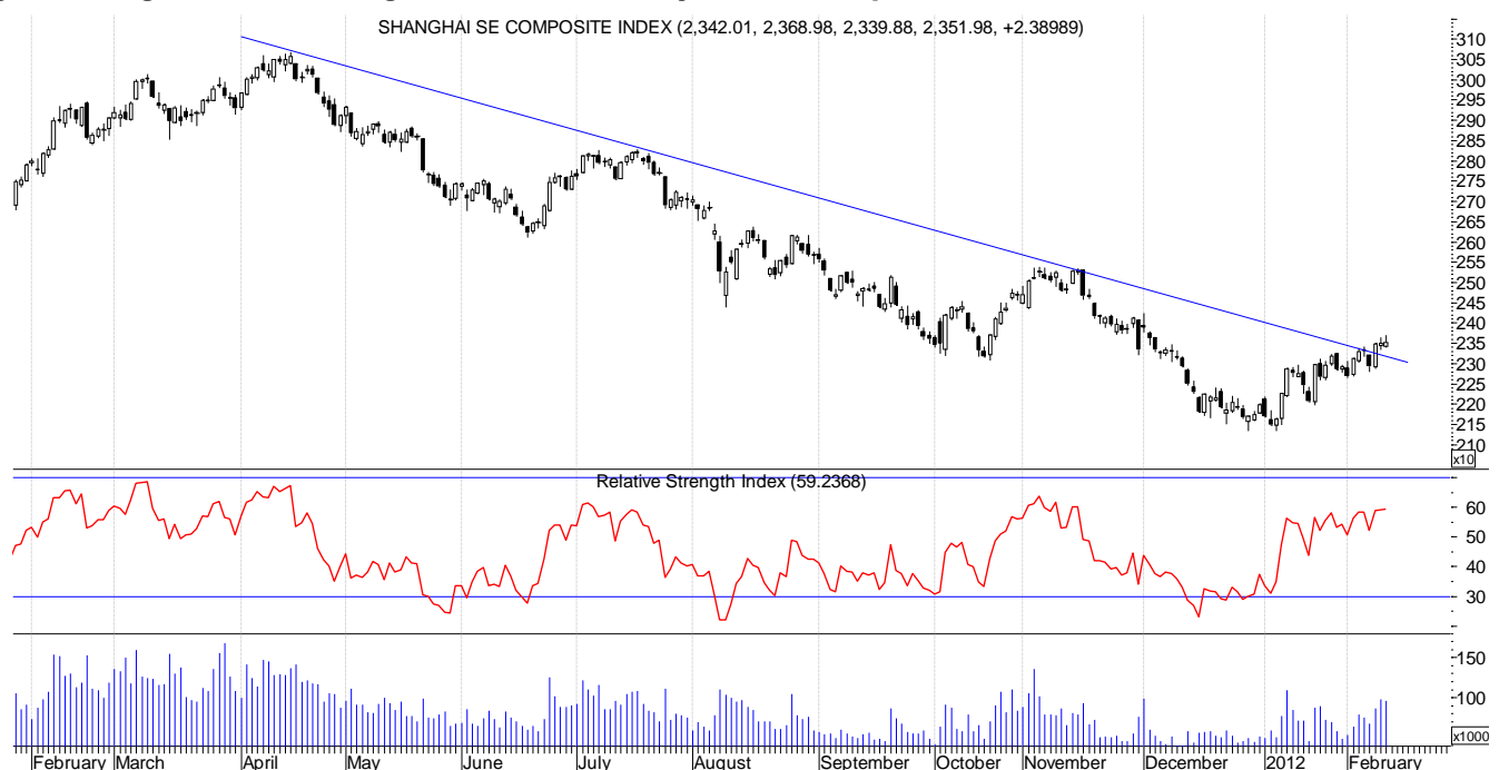
Fig 2. Shanghai Stock Exchange Bottomed in January and is Now Up 10%