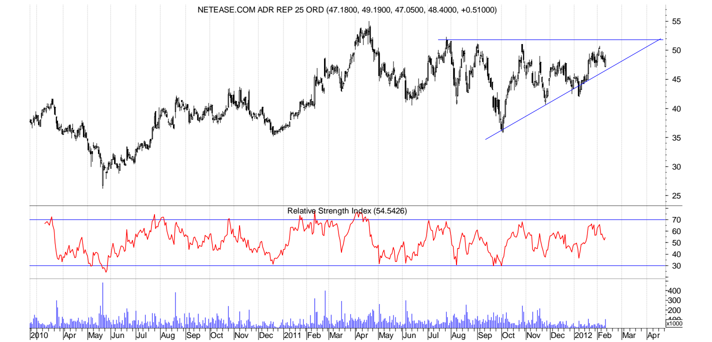
Fig 14. NetEase Ascending Triangle Suggests Uptrend May Resume Soon