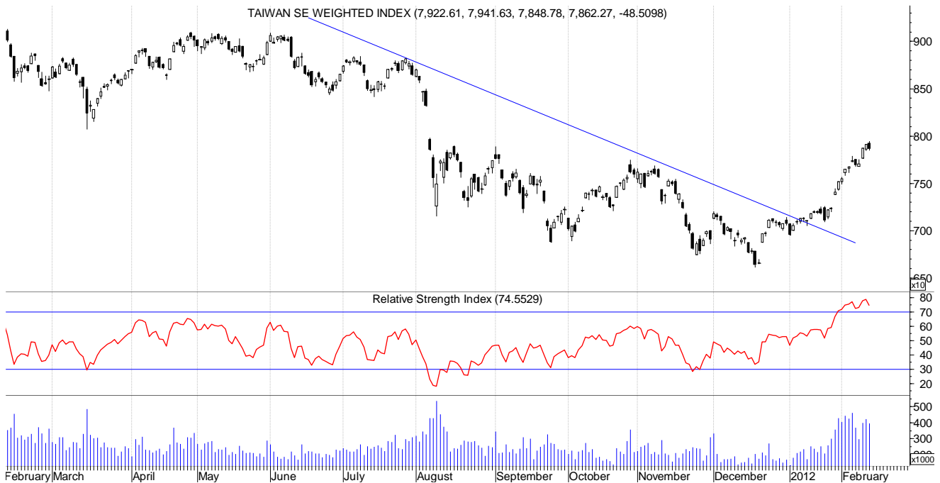
Fig 4. Taiwan Stock Exchange Broke Downtrend Earlier, in January