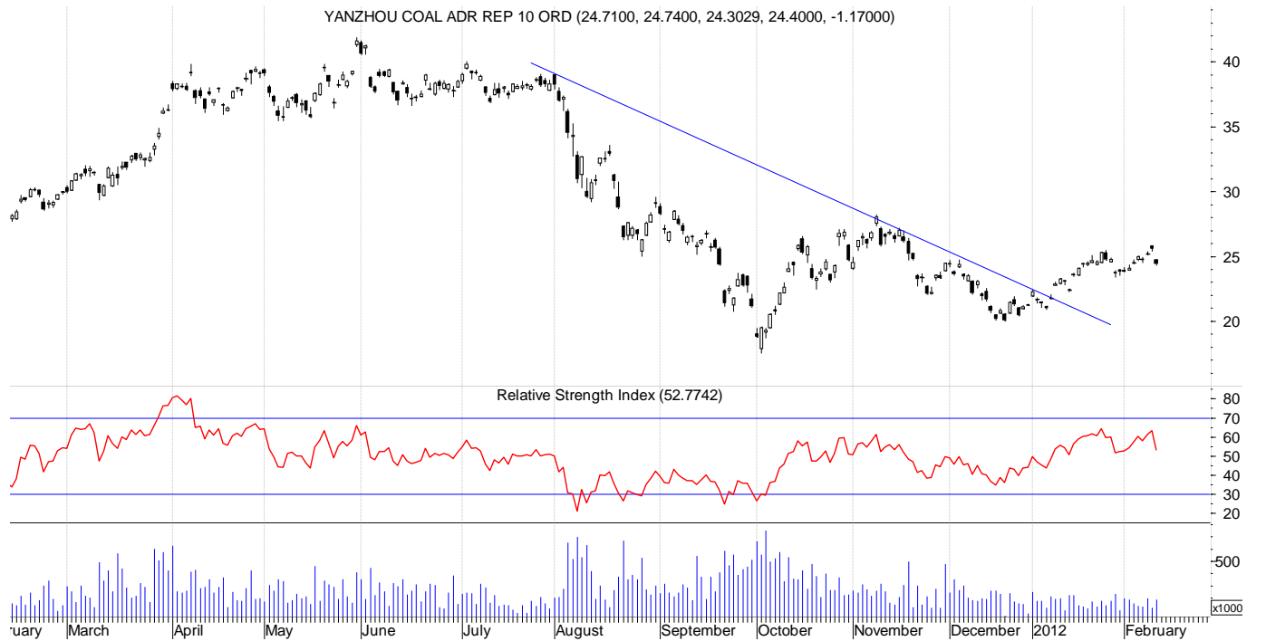
Fig 15. Yanzhou Coal Has Broken Downtrend But Shows Little Conviction on Lagging Volume